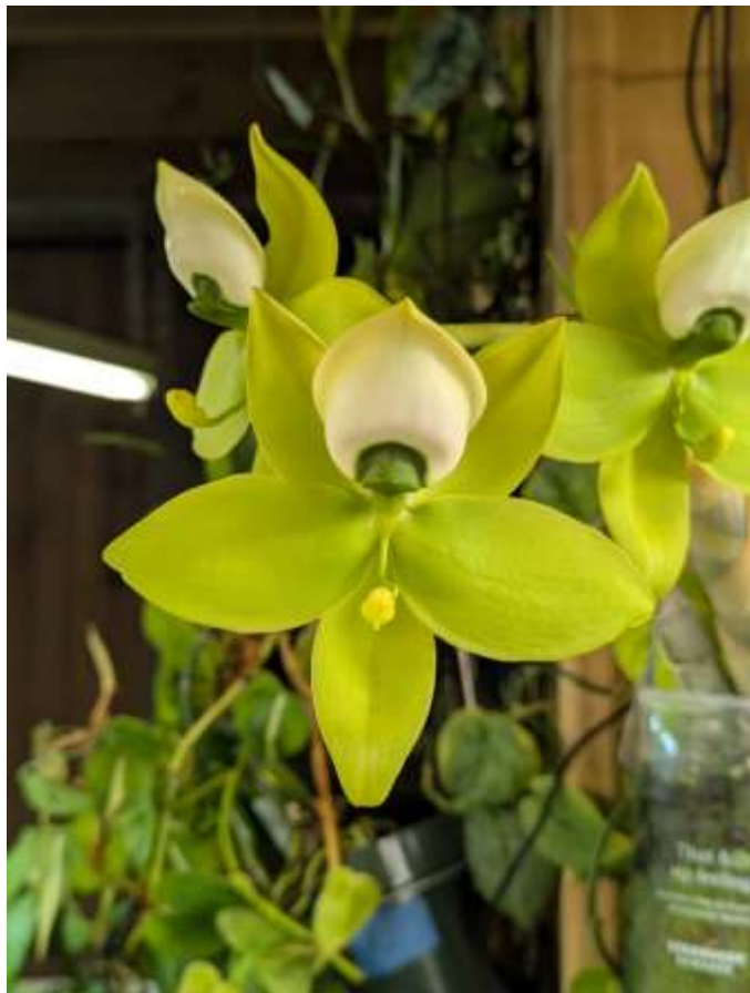
Cynoches Mass Confusion (Cyc. chlorochilon x Cyc. warszewiczii)

This series is dedicated to showing off blooms that never make it to a meeting. If you have any stubborn orchids, send photos to be included in a future newsletter: greaterakronorchidsociety@gmail.com