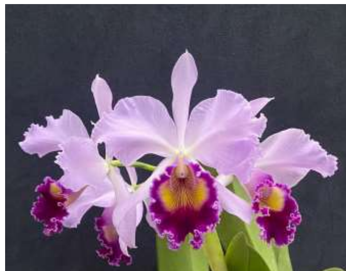
Photo of the Month: Widely considered to be the best “blue”, Lc Dinard ‘Blue Heaven’ AM/AOS (Saint Gothard x Dinah) was first made by Charlesworth in 1930.