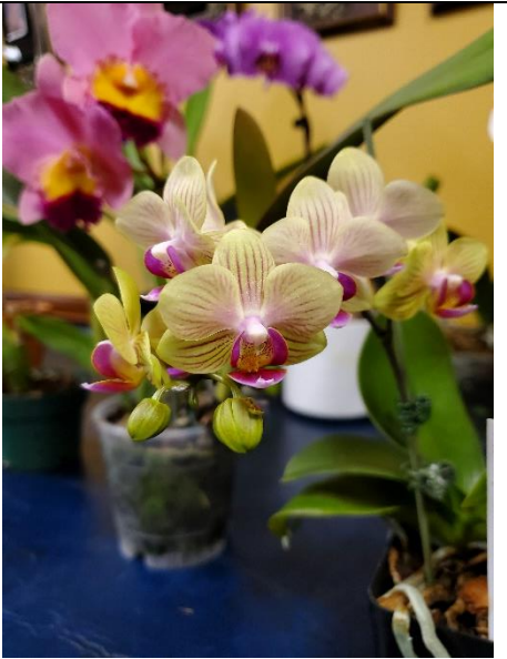
Phal Petite Pastel Jane Bush