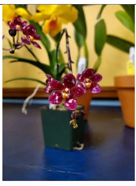
Sarco Kalnura Dazzle x Kalnura Drive Chester Kieliszek