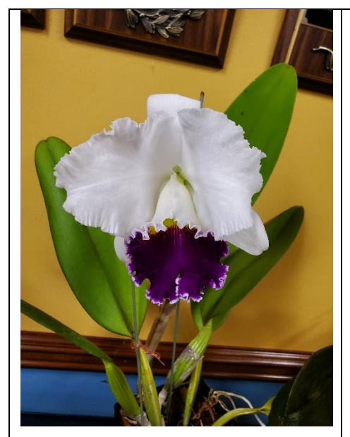
Lc Orglades Grand Jane Bush