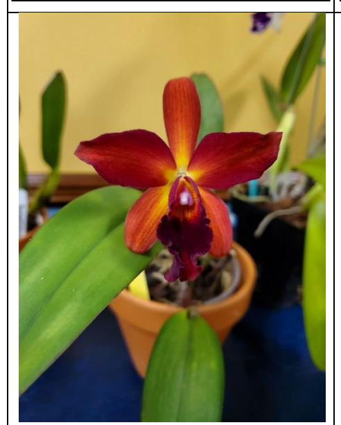
Lc Tropical Rainbow x Spring Fires Chester Kieliszek