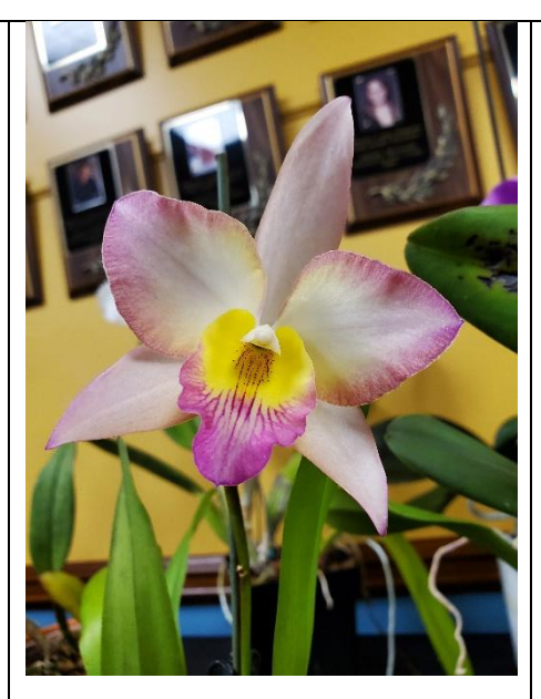
Blc Night Moves x Rlc Always Dream Jane Bush