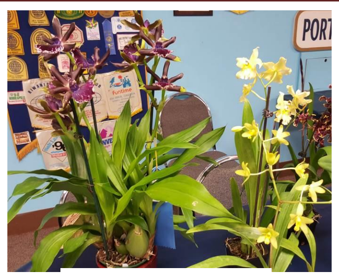
Zygopetalum - Barb Ford