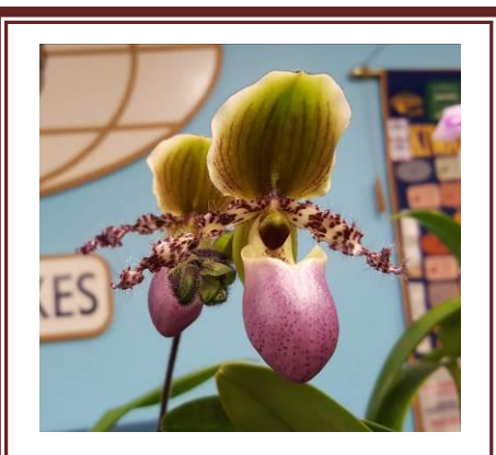
Paph. Glaucophyllum Darlene Thompson