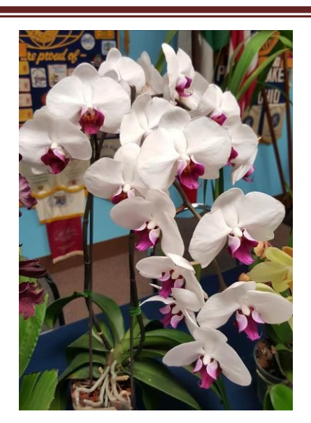
Phal Hybrid - Jane Bush