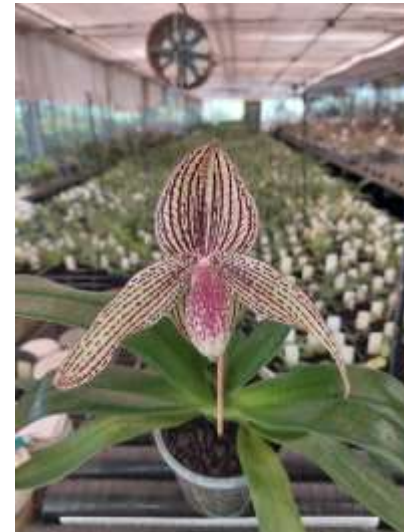
Photo of the Month: First flowering of Paph. [(Ichiro Suzuki x bellatulum) x Paph. rothschildianum] an intersectional cross between a Brachypetalum and a Coryopetalum made by Sam Tsui.