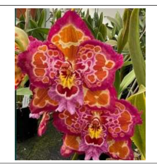
Photo of the Month: Oncidium La Ville Abbe (Onc. Westmount x Onc. Noirmont) This grex bred and then registered by the Eric Young Orchid Foundation in 2000.