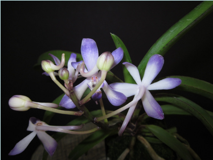
Neostylis Lou Sneary