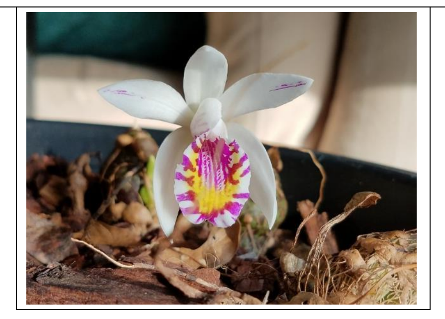
Photo of the Month: Pleione maculata is part of a small group of autumn blooming pleiones. Only 3 species all warm growers, all others are spring blooming and need a cool dormancy.