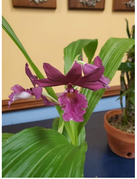
Phaiocalanthe Kryptonite Bernie Skalak