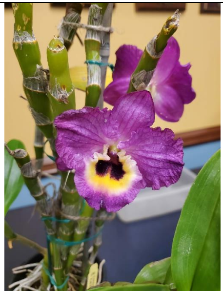
Den Red Emperor Bernie Skalak