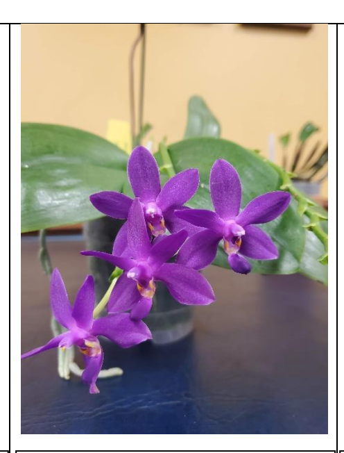
Phal Kenneth Schubert x violacea Chester Kieliszek