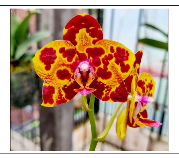
Photo of the Month: Phalaenopsis GW Green World (Phal. Tying Shin Wonder × Phal. Haur Jin Princess)

This grex bred and then registered by Yaphon Orchids in 2017.