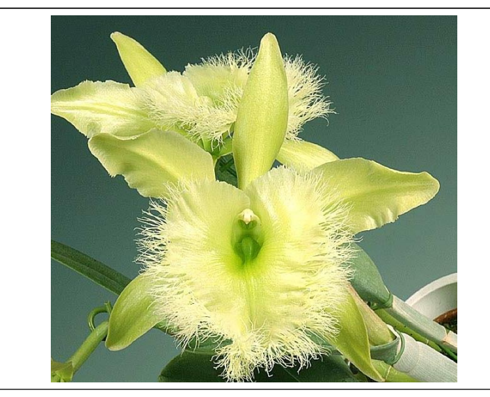
Photo of the Month: Rhyncholaelia digbyana is a hot to warm growing epiphyte from Yucatan, Campeche and Quintana Roo states of Mexico, Belize, Guatemala, Honduras and Costa Rica at elevations of around 10 to 1000 metres.