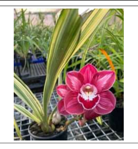
Photo of the Month: Cymbidium Rotorua 'Rose' (Ngaire x Volcano) This grex bred and then registered by Valley Orchids in 1982.