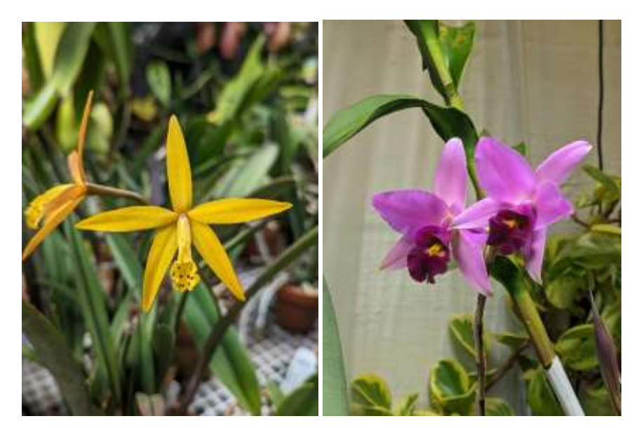
(L. Tropical Sunrise '22 Orange' x Bl. Richard Mueller '4N') / L. anceps

This was the holiday plant that I received at our November meeting. The blooms are rather large and smell faintly of cinnamon and soap, it's alittle odd. I have cut back watering it in hopes that it goes in to dormancy for a few months before spring.