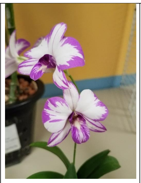
Dendrobium Splash Jane Bush