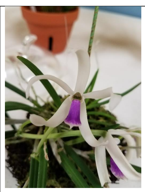
Leptotes bicolor