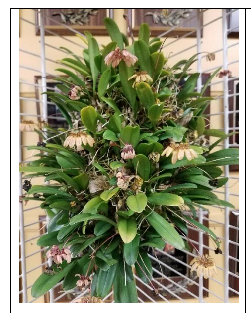
Bulbophyllum specimen Edgar Stehli