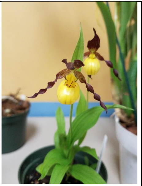
Cypripedium parviflorum