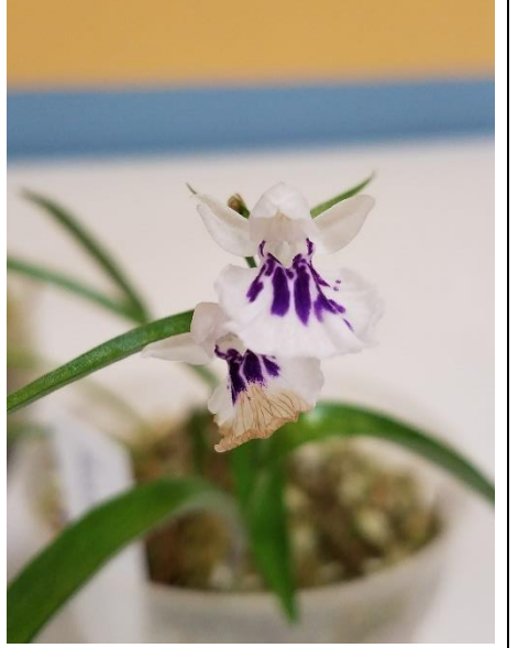
Ponerorchis graminifolia