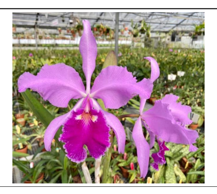
Photo of the Month: A fine dark variety of C warscewiczii - 'Beta', from my father's collection