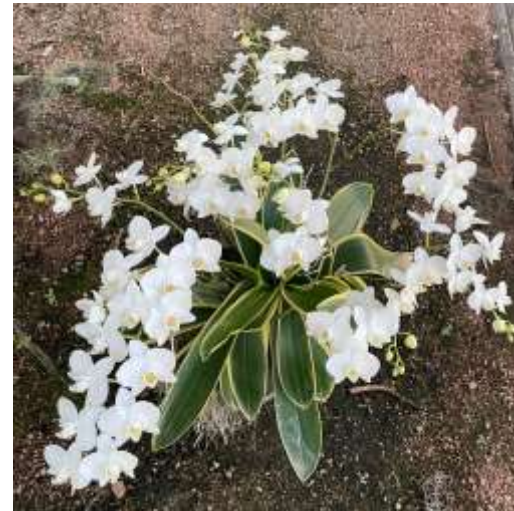
Photo of the Month: One of our display plants - 14 year old Phalaenopsis amabilis in flower. One plant with multiple growths. – Sunnyview Orchids