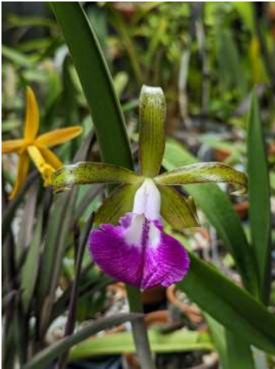
Bc. Keowee 'Mendenhall' AM/AOS

A post dedicated to showing off blooms that never make it to a meeting.