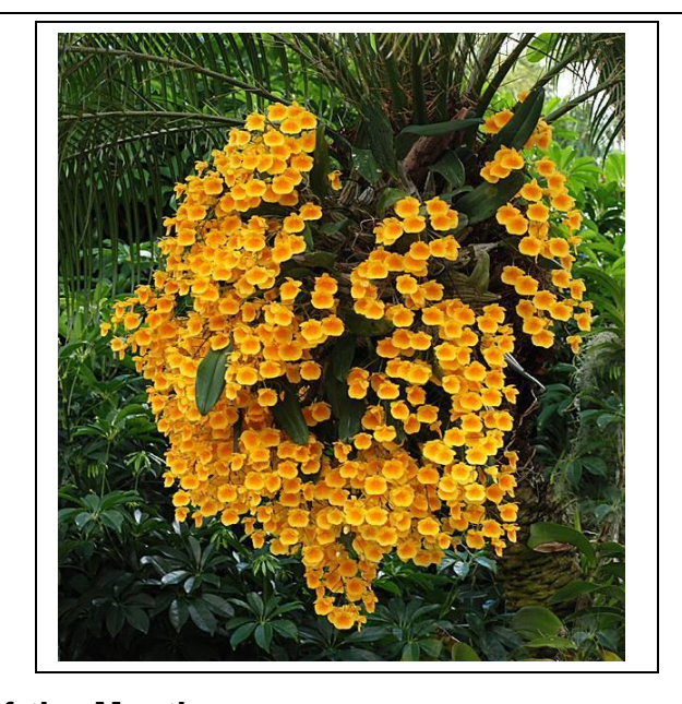
Photo of the Month: Dendrobium lindleyi at R.F. Orchids. Dendrobium lindleyi is a relatively small species of epiphytic orchid from the mountains of Southeast Asia. Native to deciduous forests from northeast India to Vietnam, Laos, Thailand and southern China, it produces spectacular showers of golden flowers.