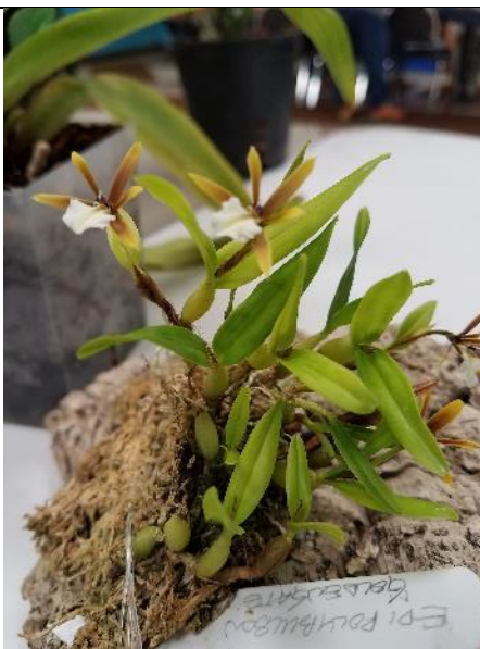
Epi. polybulbon Bernie Skalak