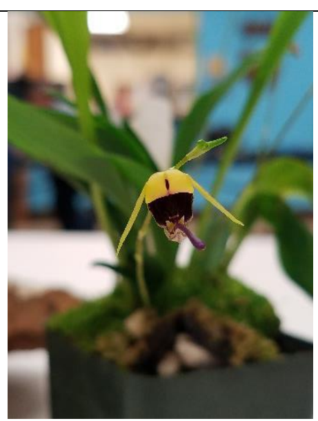
Scaphosepalum breve Edgar Stehli