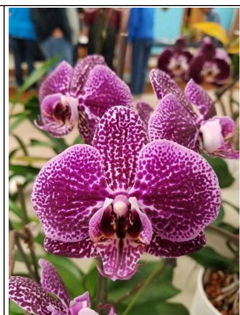
Hybrid Phalaenopsis Jane Bush