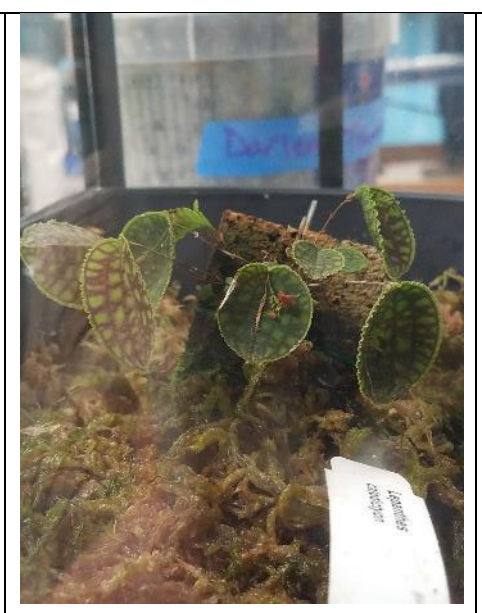
Lepanthes calodictyon