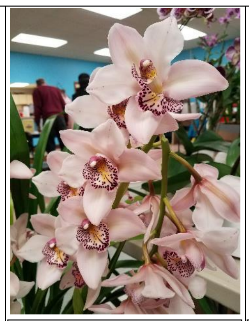
Cymbidium Jane Bush

Member Show Table from the Feb. 2017 meeting