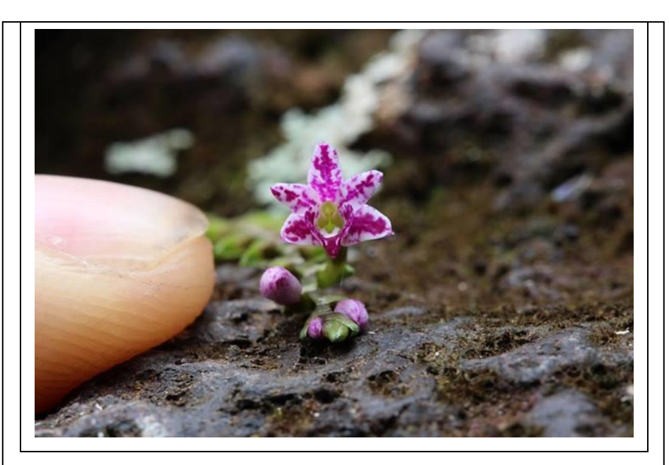
Photo of the Month: Epidendrum fimbriatum is a miniature to medium sized, cool to cold growing epiphyte or terrestrial from Colombia, Ecuador, Peru, Bolivia and Venezuela.