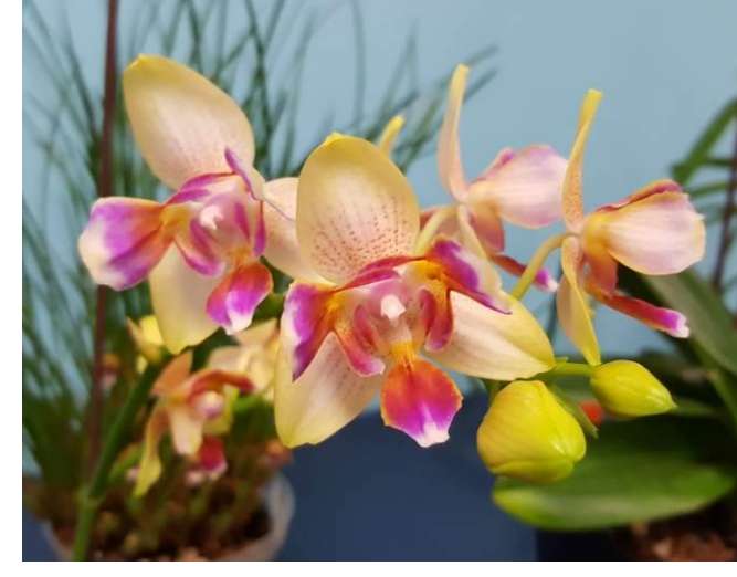
Phal. I-Hsin Venus 'Sweet Fragrant'