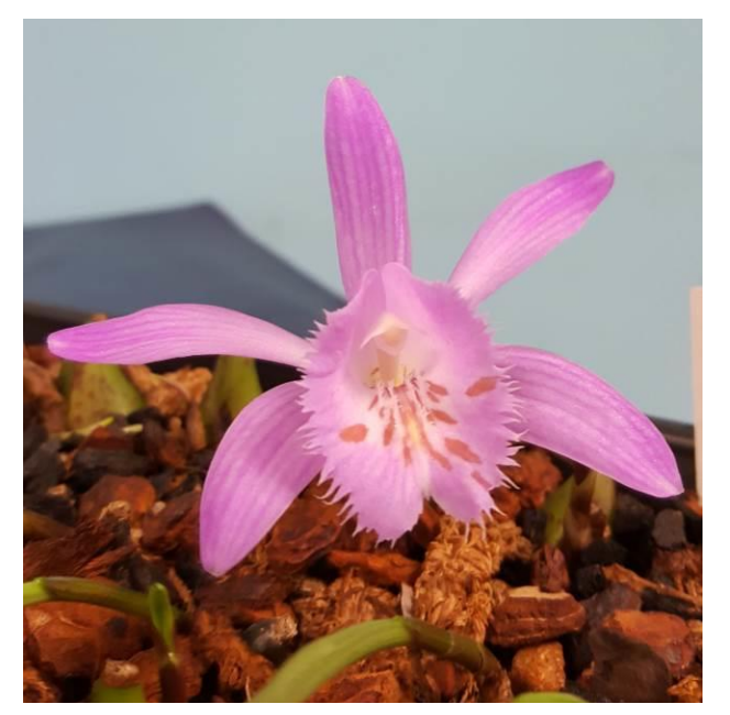
Pleione x barbarae – Brandon Spannbauer