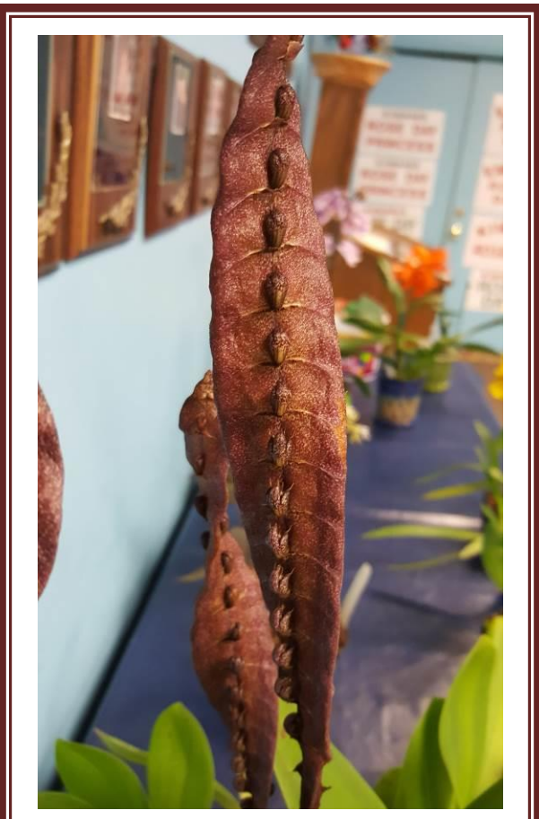
Bulbophyllum purpureorachis Edgar Stehli