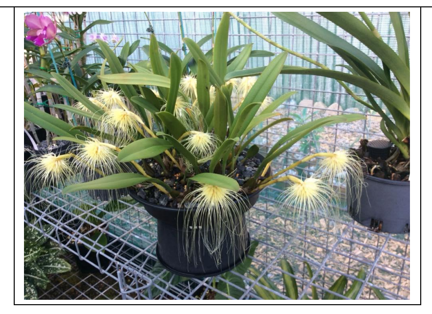
Photo of the Month: Bulbophyllum medusae: 18 beautiful, but foulsmelling flower heads.