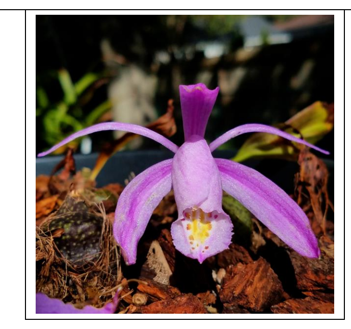
Photo of the Month: Pleione praecox is the first to bloom of my autumn blooming pleiones. This is a very small group, only 3 species all warm growers, all others are spring blooming and need a cool dormancy.