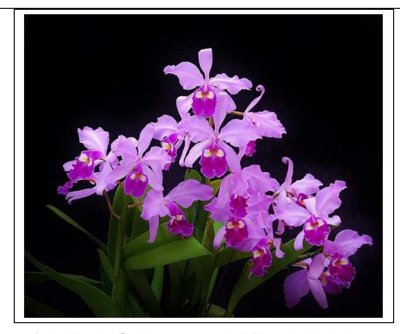
Photo of the Month: Cattleya warscewiczii 'Phoenix', is the largest flowering cattleya species, with flowers that can reach 12 inches