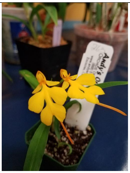
Habenaria xanthochila