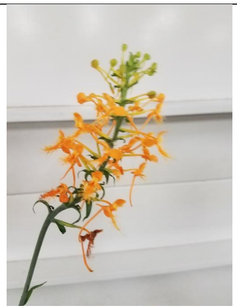
Platanthera cillia