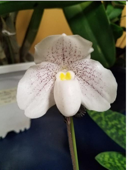
Paph niveum Jane Bush