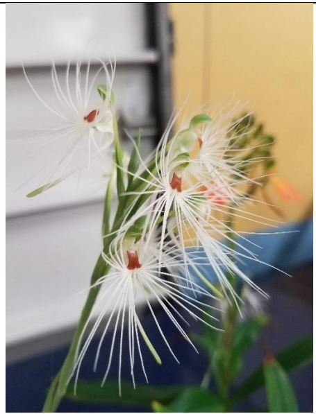
Habenaria medusa