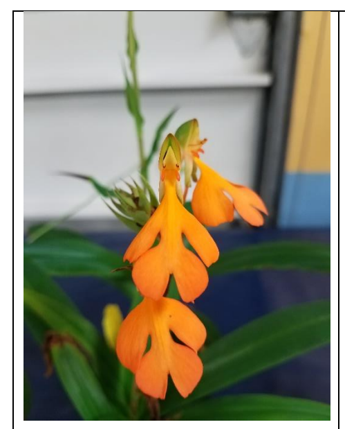
Habenaria rhodocheila