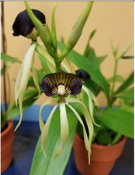
Prosthechea cochleata Pam Everett