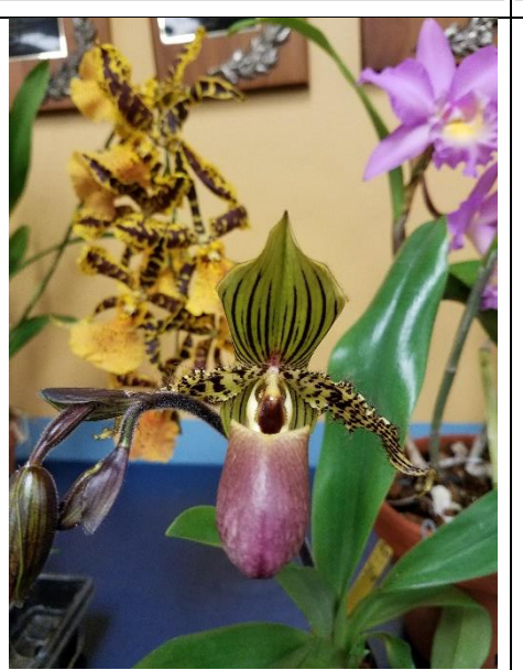
Paph glaucophyllum x roths Wayne Roberts