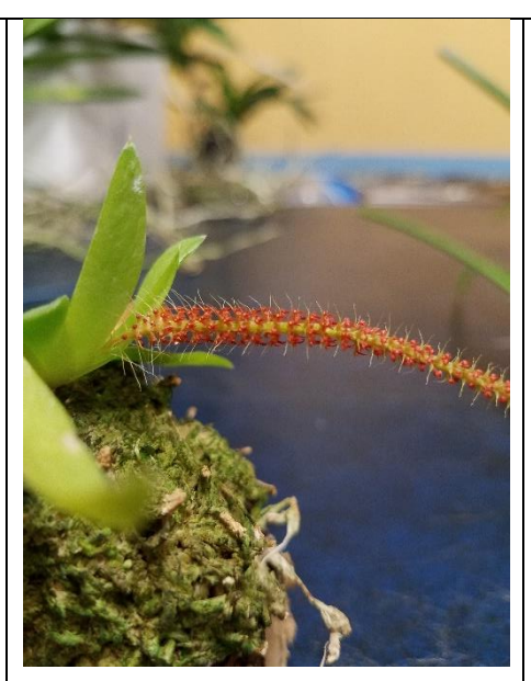
Oberonia rufilabris