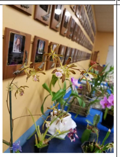
Encyclia alata x tampensis Pam Everett