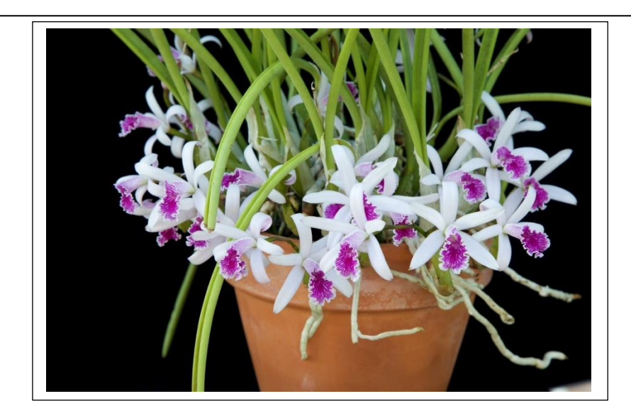
Photo of the Month: Laelia lundii. Beautiful specimen of this miniature species from Brazil. San Diego County Orchid Society