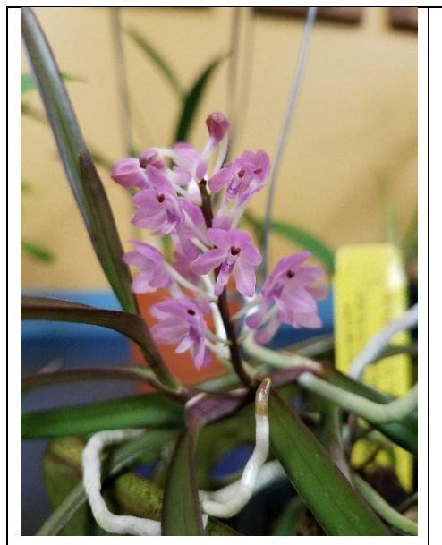
Asco christensonianum