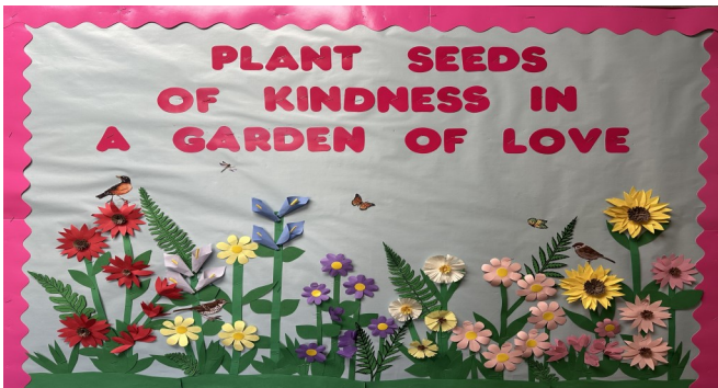
April hallway bulletin board Created by Patti Schwier