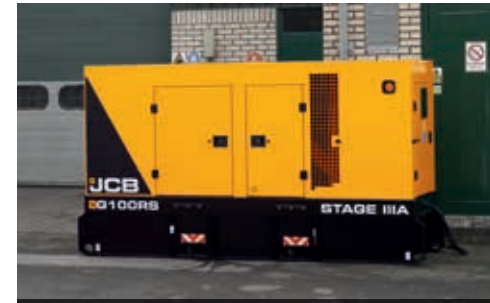
Highly versatile, powered by a wide range of engine manufacturers to suit every application.