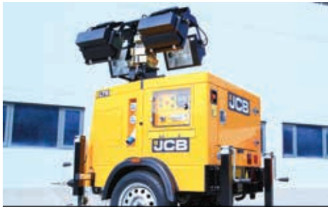
A range of high performance mobile light solutions provide efficient light anywhere.