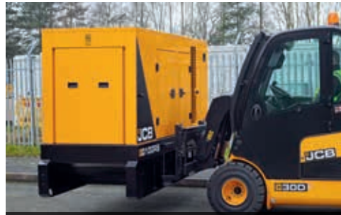
A range of lifting options for ultimate manoeuvrability and product positioning on site.