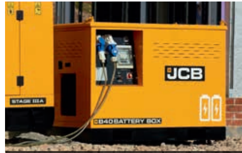
The JCB Intelli-Hybrid range provides alternative and efficient power sources.