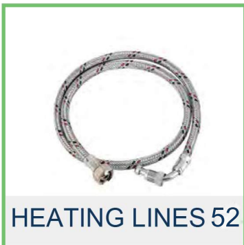
HEATING LINES 52