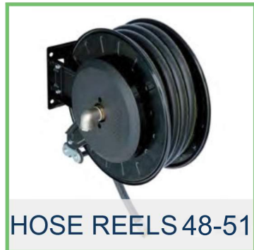
HOSE REELS 48-51