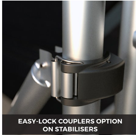
EASY-LOCK COUPLERS OPTION ON STABILISERS