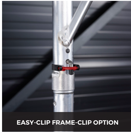
EASY-CLIP FRAME-CLIP OPTION