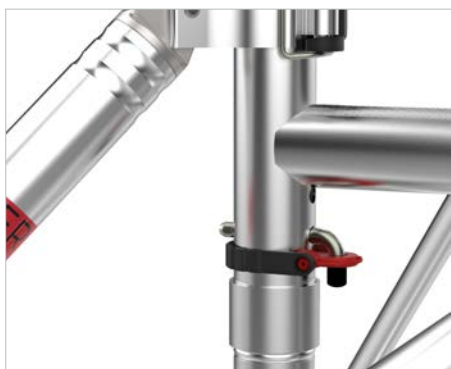
EASY-CLIP FRAME CLIPS