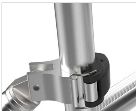
EASY-LOCK COUPLERS ON STABILISERS