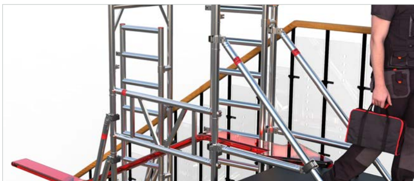
COMPLETE WALK THROUGH DESIGN (4.7 & 6.7M WORKING HEIGHT)