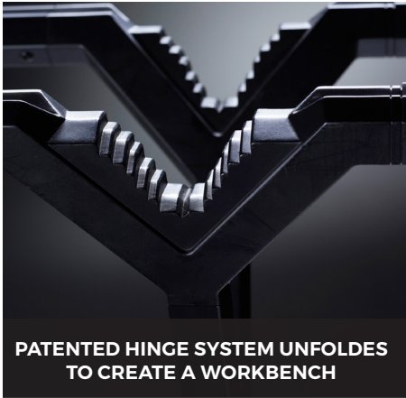
PATENTED HINGE SYSTEM UNFOLDES TO CREATE A WORKBENCH