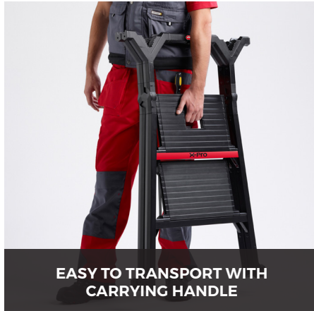
EASY TO TRANSPORT WITH CARRYING HANDLE