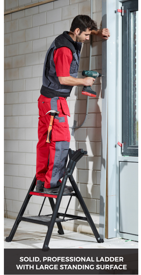
SOLID, PROFESSIONAL LADDER WITH LARGE STANDING SURFACE