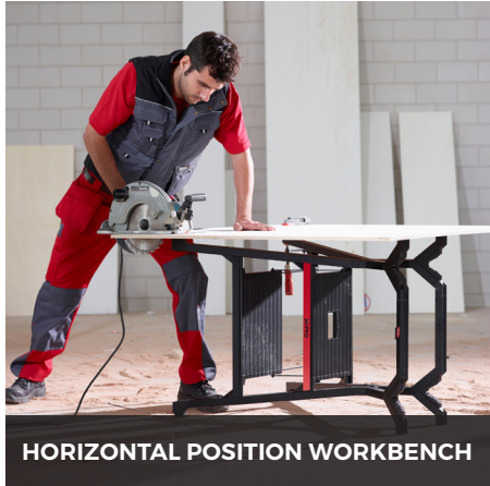
HORIZONTAL POSITION WORKBENCH