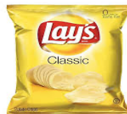
Potato chip bags