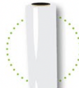
Pallet wrap & stretch film