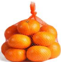
Mesh produce bags (full or partial mesh)