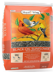
Woven or hard plastic bird seed bags