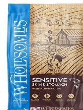
Woven or hard plastic dog food bags