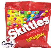
Candy bags that are "crinkly"