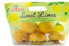
Fruit bags that are "hard" plastic