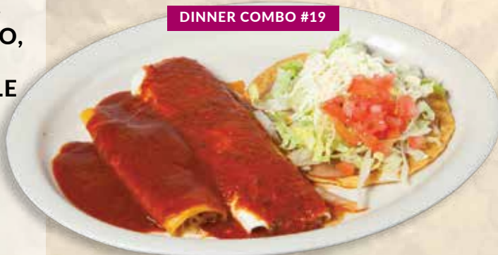
DINNER COMBO #19

Two cheese enchiladas topped with melted cheese, chopped onions, served with beans.