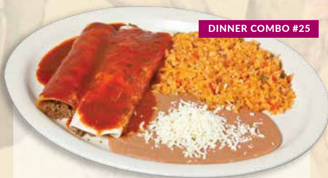
DINNER COMBO #25

SUBSTITUTE QUESO FOR RED SAUCE ON ANY MEAL $1 SUBSTITUTE ANY REGULAR SIDE FOR PREMIUM FOR $2