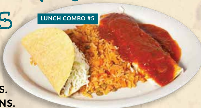
LUNCH COMBO #5