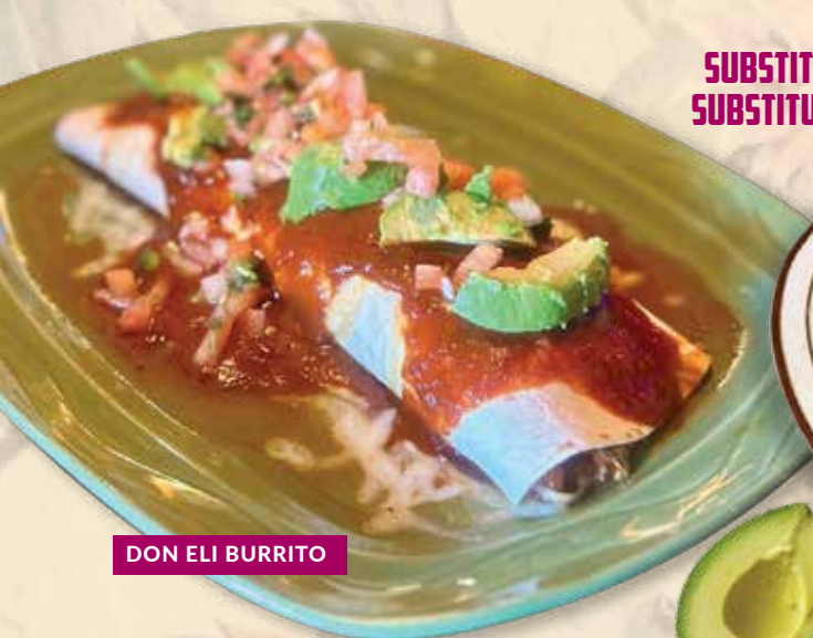
DON ELI BURRITO

SUBSTITUTE QUESO FOR RED SAUCE ON ANY MEAL $1 SUBSTITUTE ANY REGULAR SIDE FOR PREMIUM FOR $2