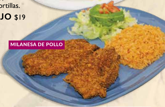
MILANESA DE POLLO