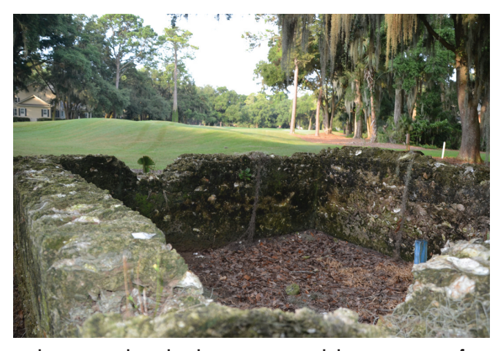
Looking across the Delegal gravesite, toward the quiet setting of the golf course