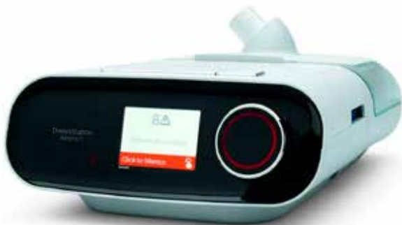
DreamStation® BiPAP S/T with Heated Humidifier