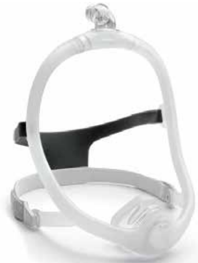
DreamWisp Nasal Cushion Mask