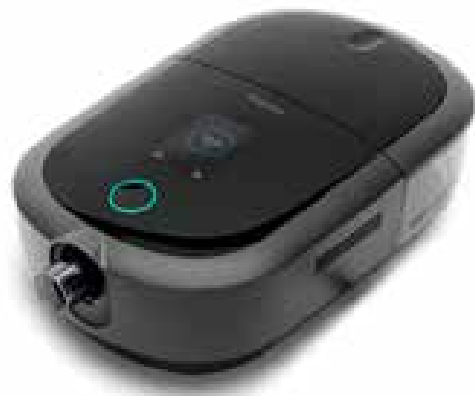
Philips Respironics DreamStation 2 Auto CPAP Machine