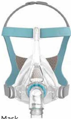
Vitera Full Face Mask