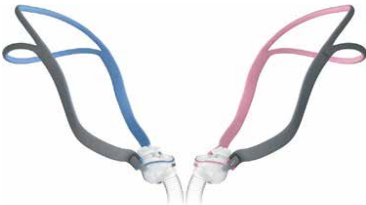
AirFit P10 (His and hers)