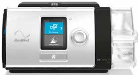
AirCurve 10 ST-bilevel