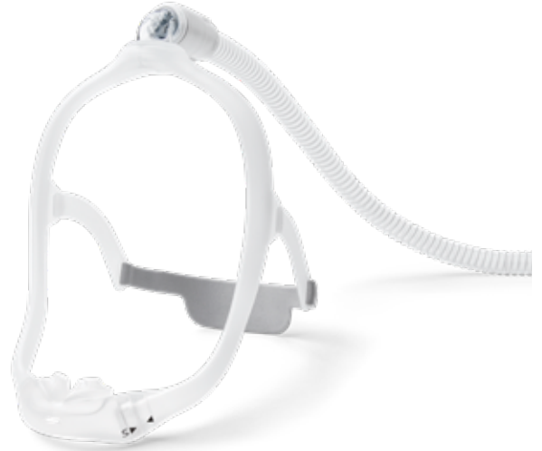
Dreamwear Nasal Cushion Mask