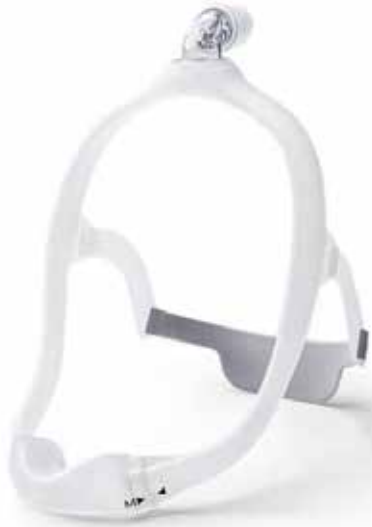
Dreamwear Silicone Pillow Mask