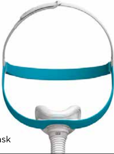
Evora Nasal Mask