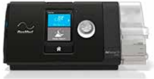
AirSense 10 AutoSet CPAP Machine