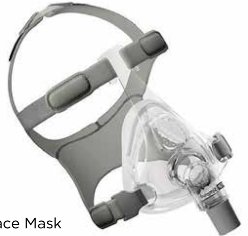
Simplus Full Face Mask