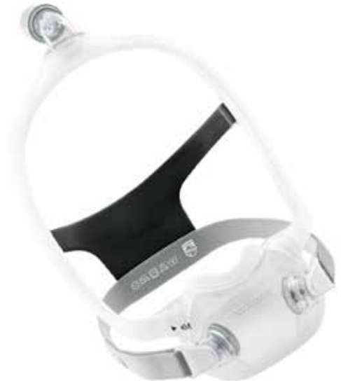
Dreamwear Full Face Mask