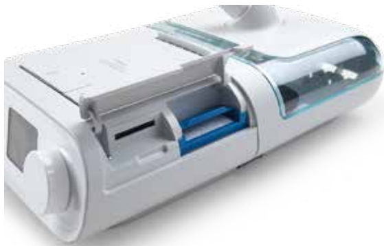
Philips DreamStation® Auto BiPAP with Heated Humidifier and Cell Modem