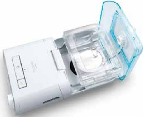
Philips DreamStation® Auto CPAP with Heated Humidifier and Cell Modem