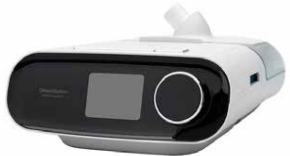
Philips DreamStation® BiPAP autoSV with Heated Humidifier and Cell Modem