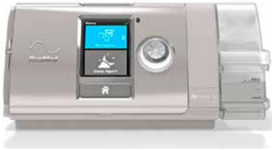
AirCurve 10 S Bilevel