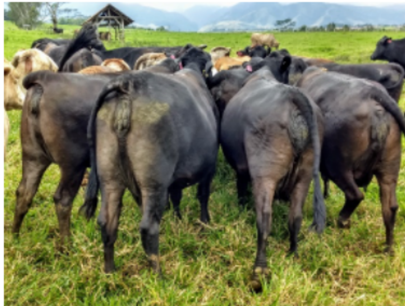
1. Selection of Cows and Heifers