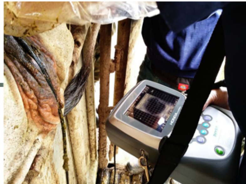
7. Pregnancy Diagnosis