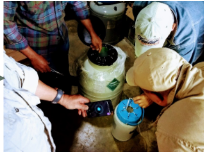
2. Selection of Genetics