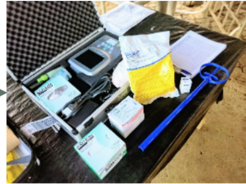
3. Preservice Exam by Ultrasound