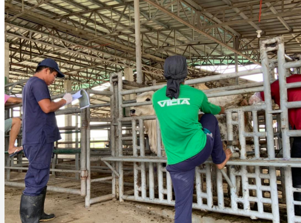
Victa Ranch Mexico, Pampanga