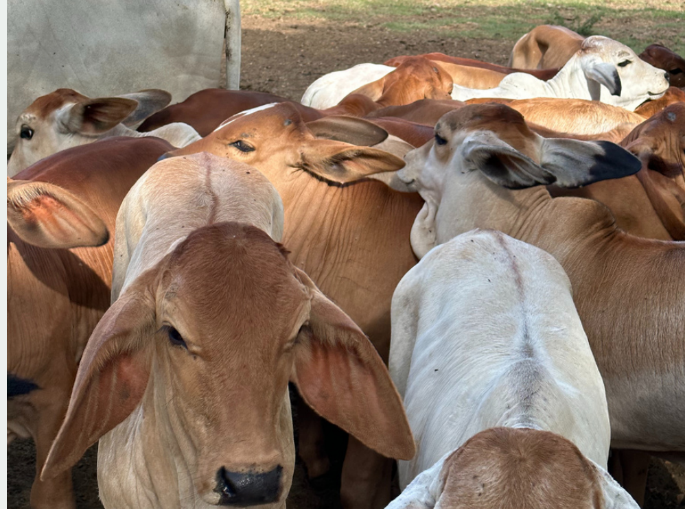
Rancho Consuelo Canlubang, Laguna