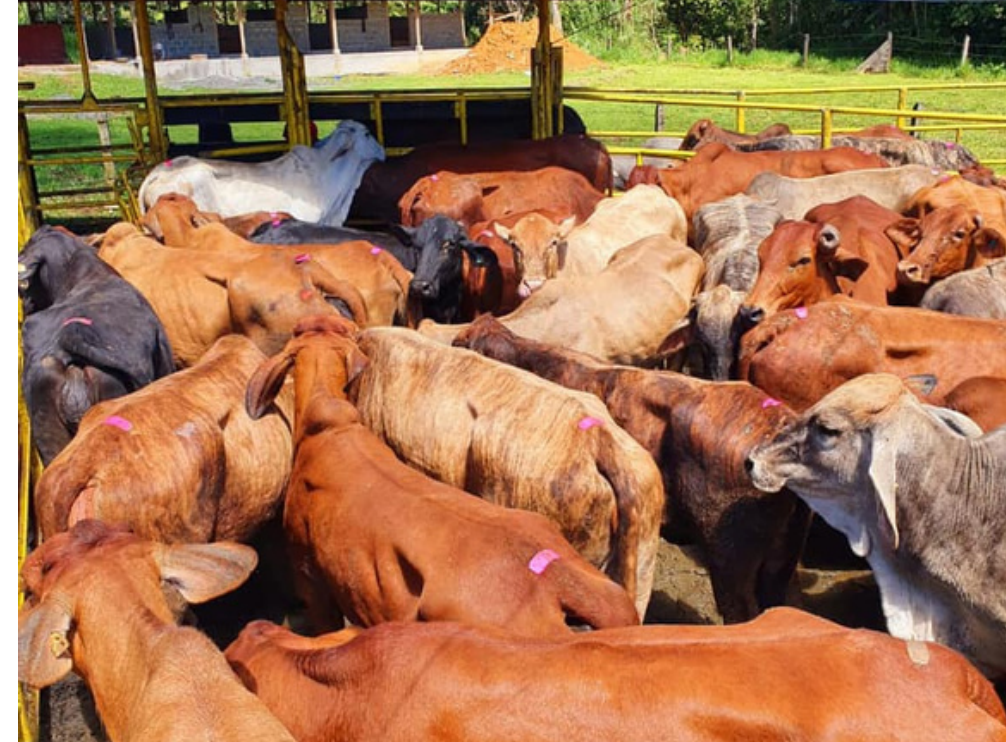
M. Montesclaros Farms Valencia, Bukidnon