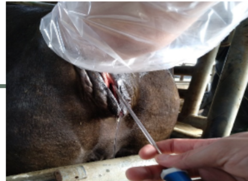
6. Fixed Time AI