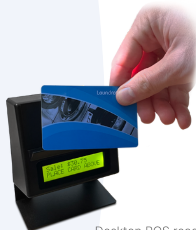
Desktop POS reader