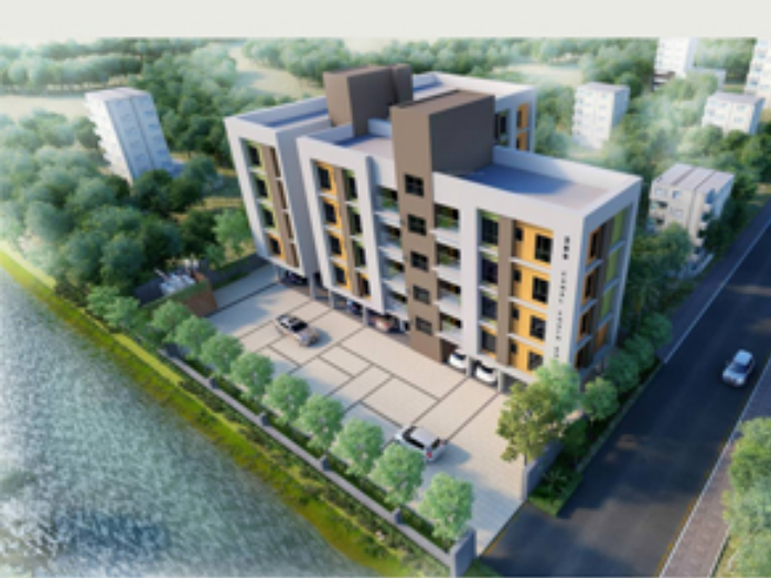
Gurukul Lakeview Canal Road, Kolkata