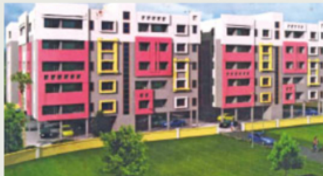
Panchawati Residency Barbil, Odisha