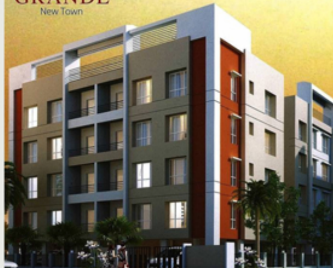
Gurukul Grande New Town, Kolkata (Phase I, II, III, IV)