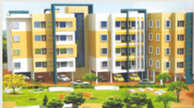
Pearl Heights Rourkela