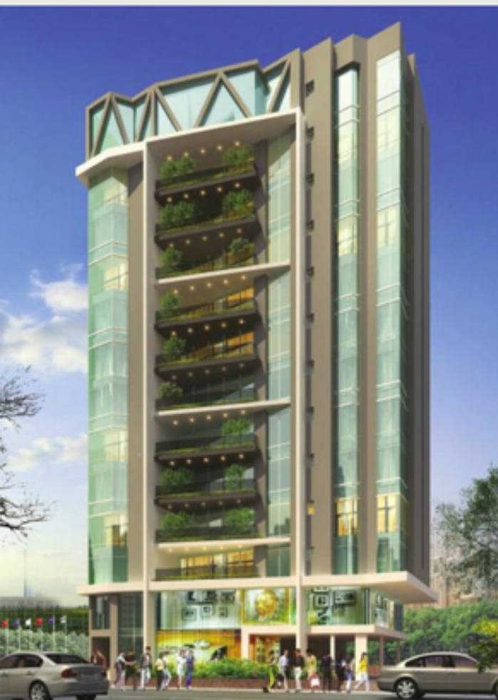
Gurukul Grandeur Hazra Road, Kolkata