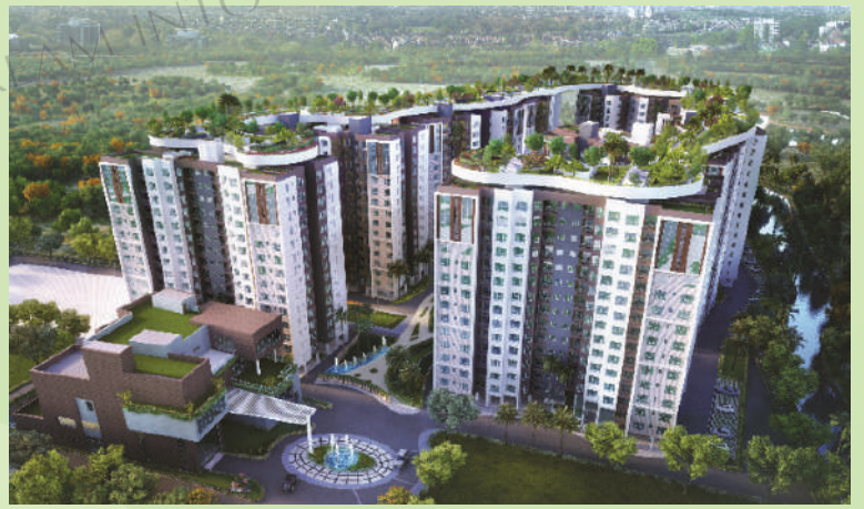
Siddha Galaxia, New Town, Kolkata