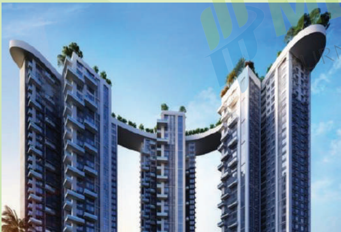
Siddha Sky, Off EM Bypass, Kolkata

Siddha believes that the magic of craftsmanship lies beyond the reality of construction. It is the ability to sculpt better lives by designing and crafting living spaces that sets Siddha apart.