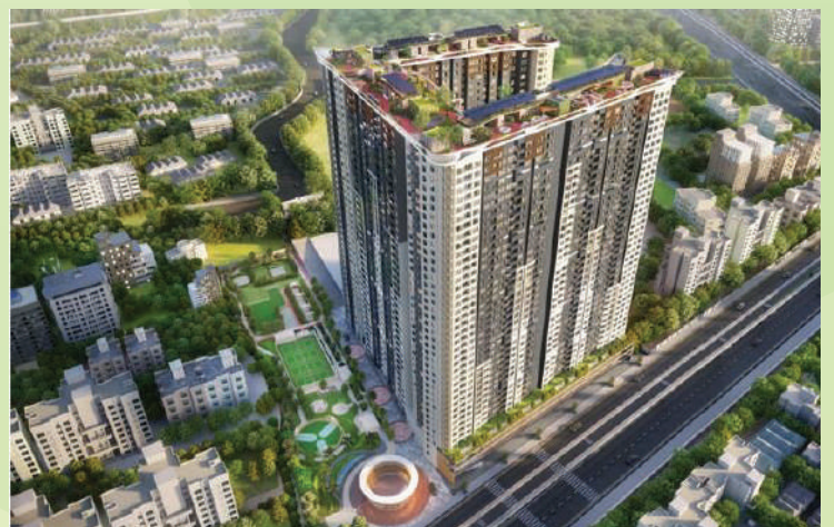
Siddha Sky, Beside GTB Monorail Station Wadala Mumbai