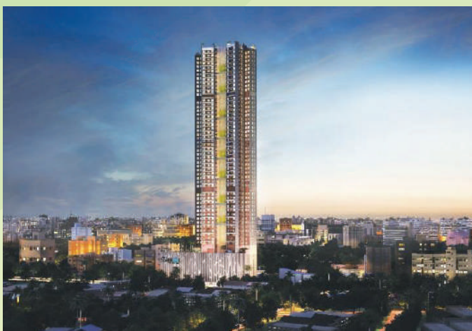
Siddha Seabrook, Kandivali(W), Link Road Mumbai (Handover started)