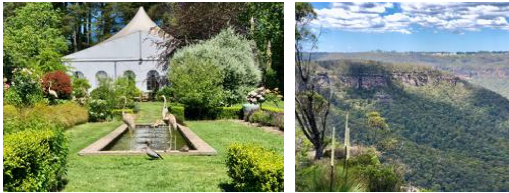
Bird sculptures and live ducks in the gardens of Parklands (left) and Flowering Grass trees and distant view of the Hydro Majestic from Hargraves Lookout (right)

We continued driving west to Millthorpe to visit Derek (Anne's nephew) and Lisa's new farm 'Daleside' between Bathurst and Orange. They had spent the earlier months of 2020 making major house improvements and removing the effects of the previous tenant's depredations – it is now a very comfortable and spacious house with a large unruly garden.