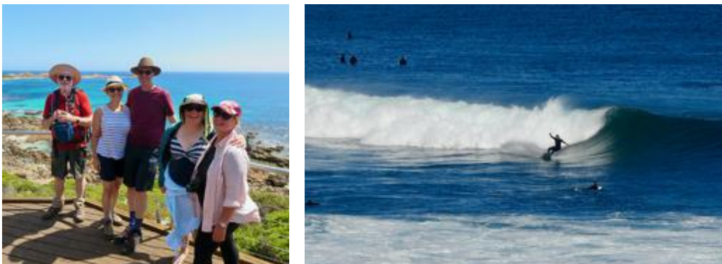
Walkers at Canal Rocks Lookout (left) and Surfers at The Three Bears (right)