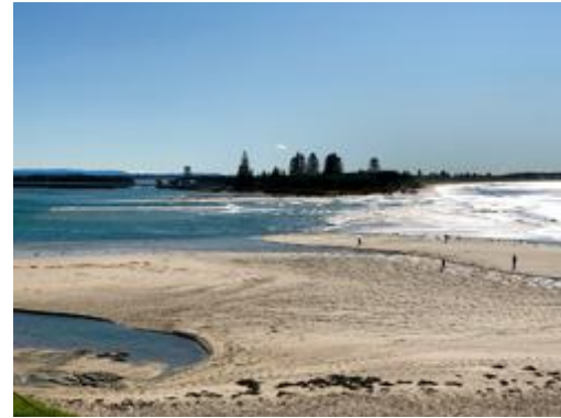
Glengara Walking Group: Birdlife at southern end of Tuggerah Lake (left) and The Entrance after the bar was washed away (right)

At the end of November 2020, we were able to celebrate our Christmas 2019 dinner in the Blue Mountains. We had to cancel this in 2019 due to the bush fires, and then rebooked and cancelled again due to Covid-19. Finally, we made it. We stayed two nights at the very up-market retreat ‘Parklands’ in Blackheath and dined out at the Hydro Majestic down the road – together with fabulous sunset views over the Megalong Valley. A few National Park viewing spots were also enjoyed in the district together some minor walks.