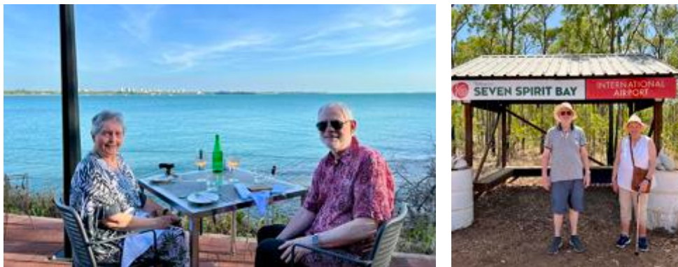
Special dinner at Pee Wee's at the Point and arriving at Seven Spirit Bay's International Airport

Activities were completed by a sumptuous lunch for everyone at tables above the beach at Kennedy Bay (to the east of the Lodge). After our flight back to Darwin we all enjoyed a sunset dinner cruise on Darwin Harbour. We stayed on for a further night in Darwin and devoured a great dinner at Hanuman, a well-known restaurant featuring excellent Indian, Thai and Malaysian food.