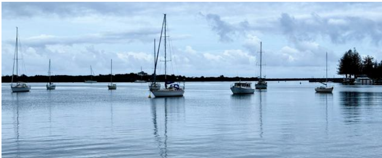
Evening light on the river at Port Macquarie