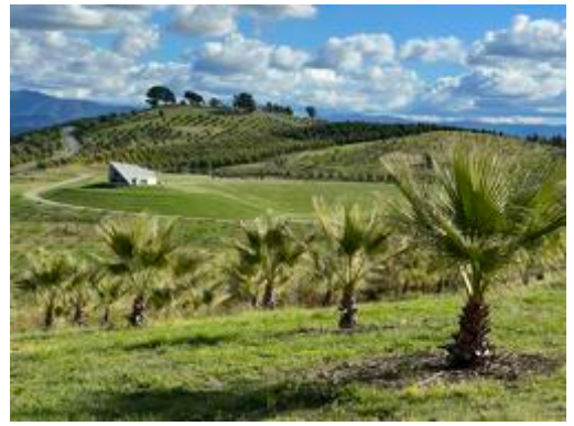
Canberra Glassworks, National Museum of Australia and the National Arboretum