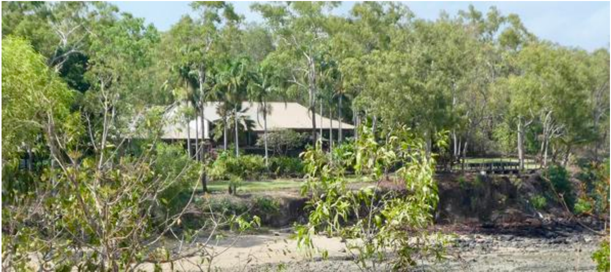
View of the Lodge