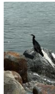
Port Macquarie's Rocky Beach and a Shag on a Rock