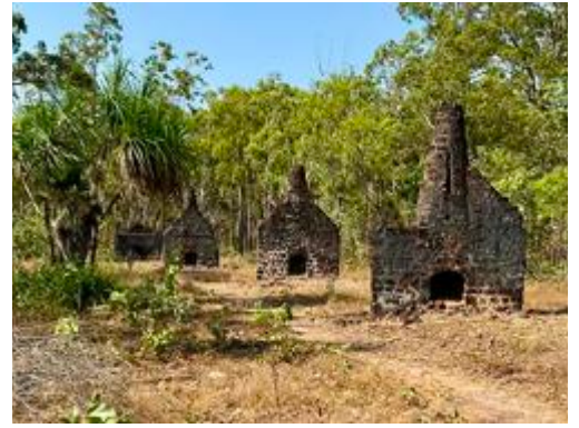
Grave, Hospital Kitchen and Married Quarters at Victoria Settlement