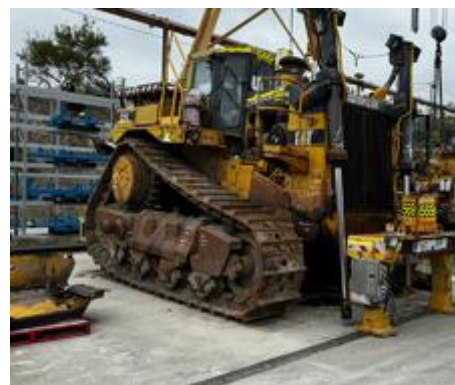
The Big Crane at Expressway Spares and a tracked vehicle being worked on