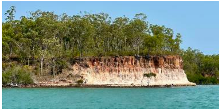
Trees clinging to eroding bank and Evans Head