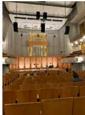
Sydney Circular Quay Bird sculptures with real birds (in June) and Sydney Recital Hall (in August)