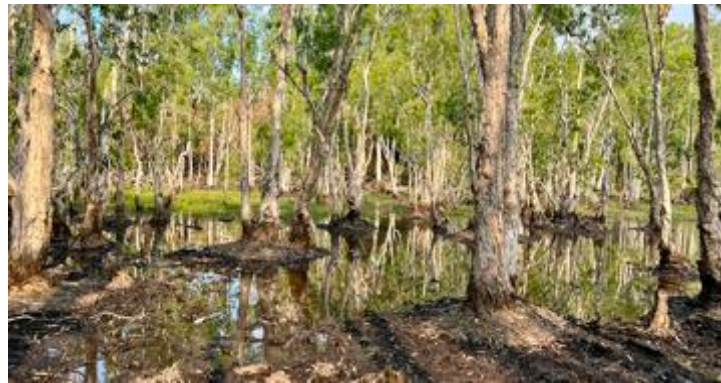
Nypa Palms and Alaru Creek