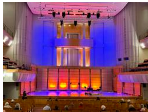
Cirque du Soleil stage for “Crystal” at Qudos Bank Arena (in August) and Sydney Recital Hall (in September)