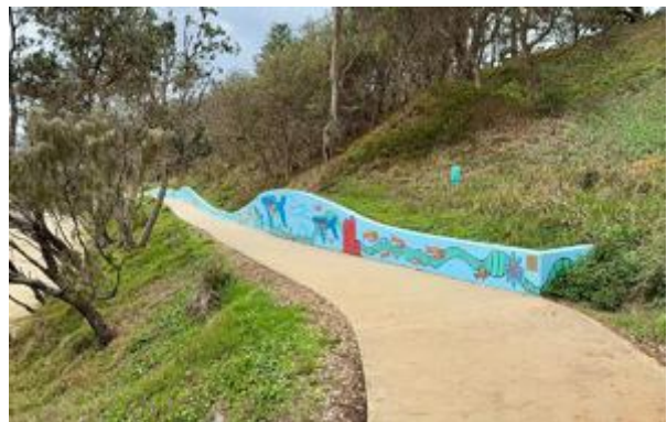
Port Macquarie's River Walk with painted rocks and Start of the Coastal Track near Town Beach