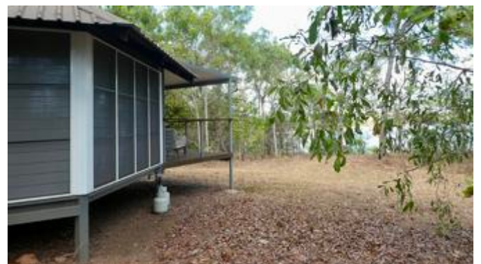
Our "room-with-a-view" accommodation

In late November we took a road trip to Port Macquarie to visit friends. The weather was a bit damp (raining nearly every day) but we managed to see everyone – Jenny Reeve, Keri and Milly but missed out on seeing Marg Newman whose accommodation was in lockdown with Covid.