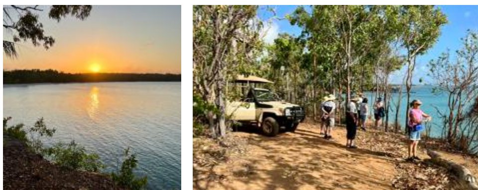
Sunset at the Lodge and some of our group at Gunner's Quoin