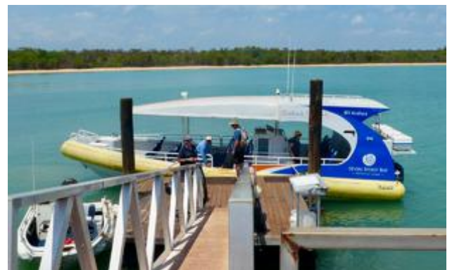
View of Lodge's Jetty with small boat for fishing and the MV Arafura at the Lodge's Jetty on our return