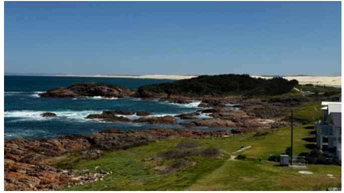
Whales and Coastal Views at Boat Harbour, Port Stephens