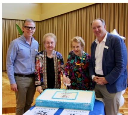
Glengara 25th Anniversary – storyboards (view and chat), decorations, speeches audience, cutting the cake ceremony