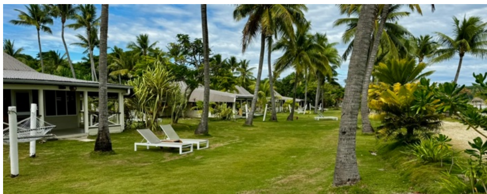
Fijian Welcome Choir and Beachside Buras at Musket Cove Island Resort

During the rest of the year, we stayed in Australia but did get away to Mollymook and Nelsons Bay for a few days of enjoyment and relaxation.