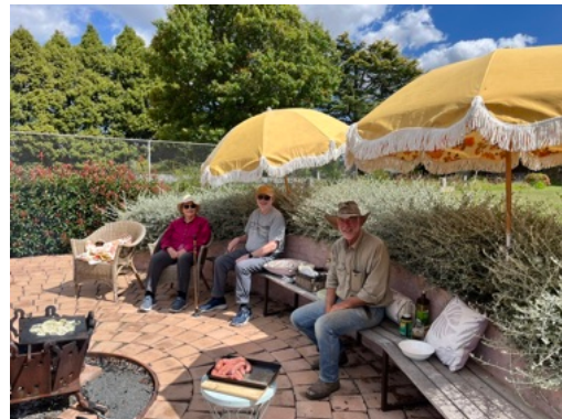
At the farm