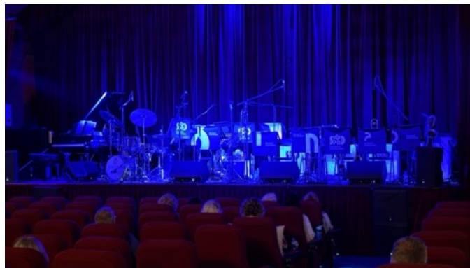
Avoca Beach Theatre enlarged stage for James Morrison and the Big Band Liechtenstein