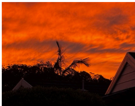
Sunset at Glengara