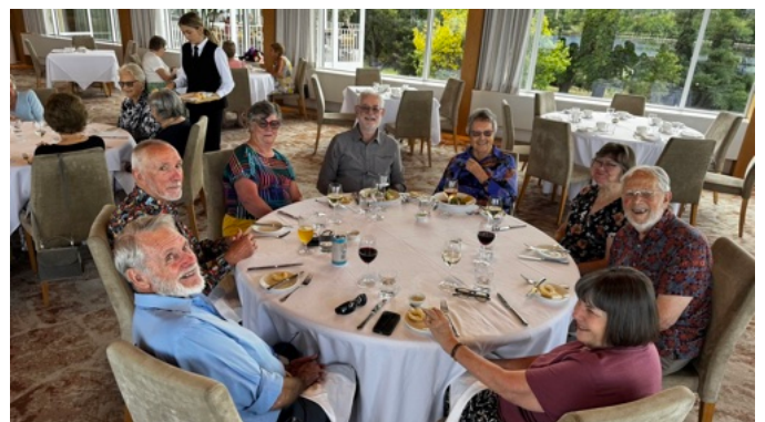
Reunion at The Marion