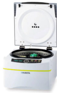
Multipurpose Centrifuge S500 Series S500 Series