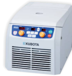
Tabletop Micro Refrigerated Centrifuge 3520-3520H