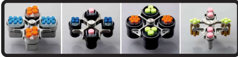
ST-724M 16 × 15mL conical tubes; 8 × 50mL conical tubes