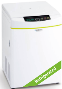
Floor-standing Refrigerated Centrifuge S500FR