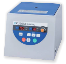
Tabletop Micro Centrifuge 3300