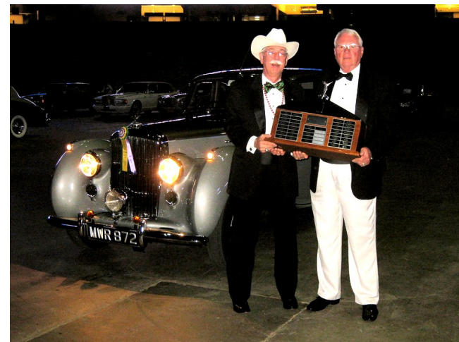
SDR members enjoy the many activities of the New Orleans Annual Meet.