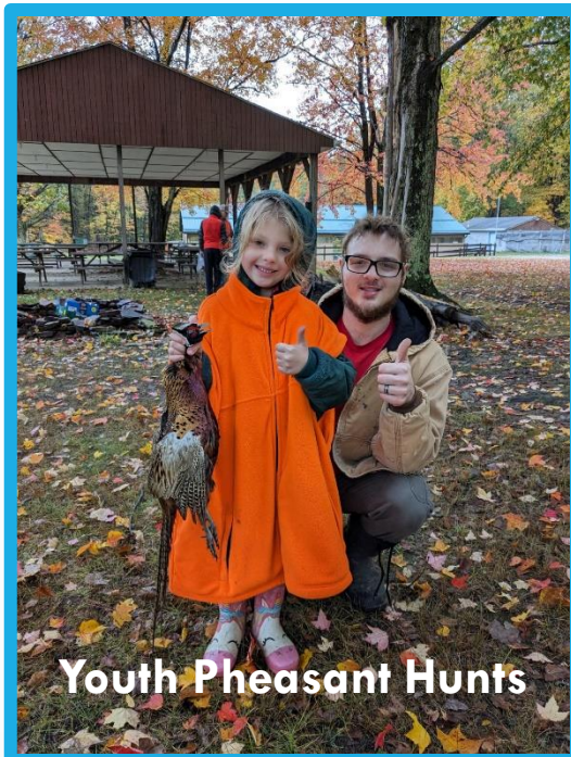
Youth Pheasant Hunts