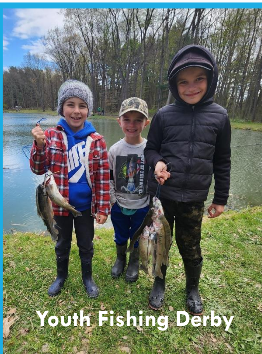
Youth Fishing Derby

Spring Thaw Banquet Committee Trumbull County Rod and Gun Club