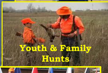
Youth & Family Hunts