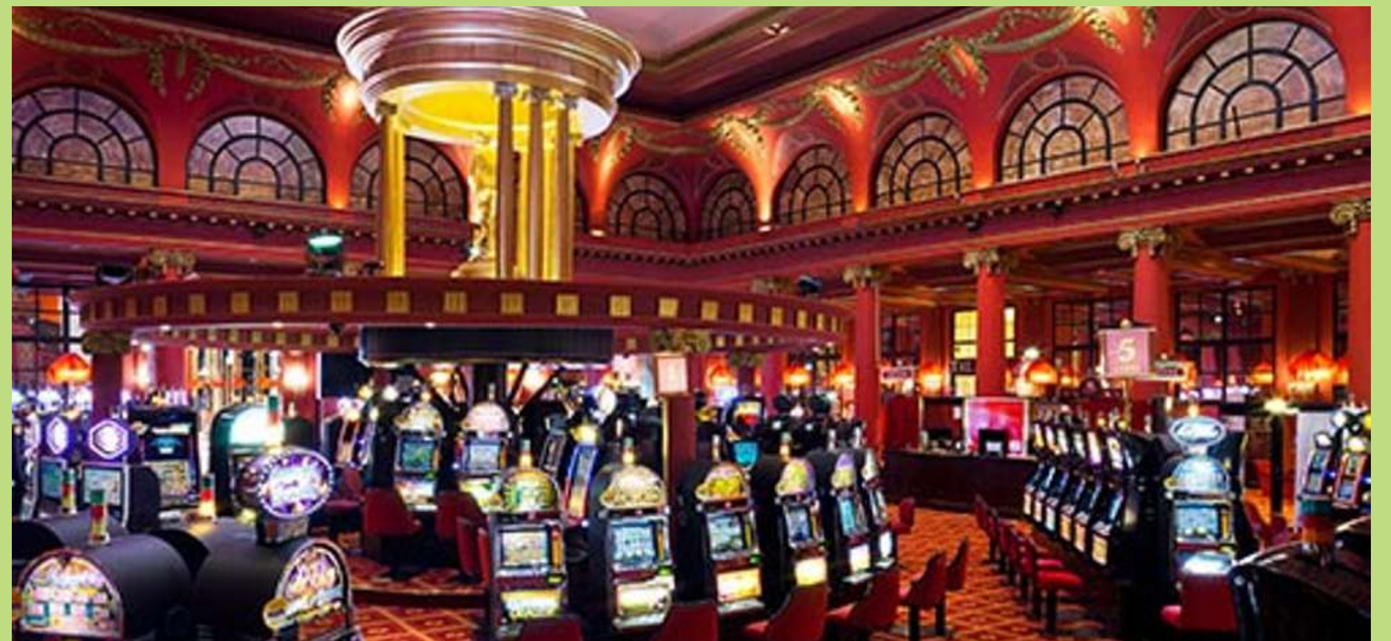
Paris to Deuville enjoy sunny beach/Casino & bikini