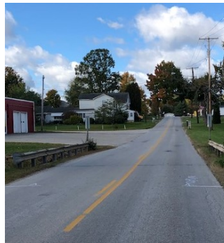
Our normal view of the Marcy Road Bridge

Marcy Road will be closed by the County from October 13 To November 10 for bridge replacement. The closure will be between Route 7 and Creek/Cemetery roads.