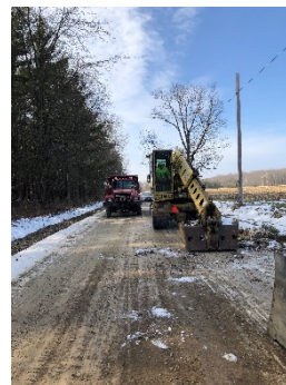
Berm removal on Turner Road

Road Work: Weather Permitting! The rain stopped and the snow held off----January 12-14 and Road Work was being done!