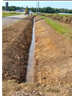
New ditches on Lewis Road