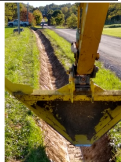
Trapezoid Bucket ditching on Caine Road