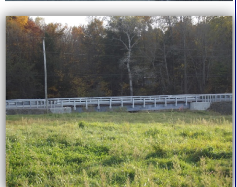
April 2020 Penn Line Road Culvert Project