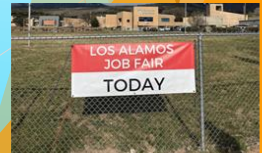
UNM-LA Job Fair