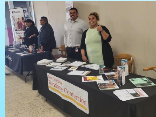
Rio West Mall Job Fair-Gallup