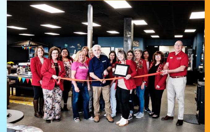
Navajo Transitional Energy Company Ribbon Cutting- Farmington