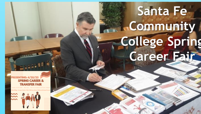
Santa Fe Community College Spring Career Fair