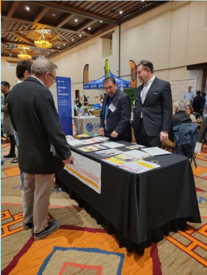
Santa Fe Business Expo And “TRADE-ing Up Your Skills” Panel

NMWFC Staff Networking, Training, and Outreach