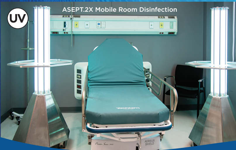
UV ASEPT.2X Mobile Room Disinfection

A mobile disinfection system that provides Log 6 reduction in just 5 minutes.