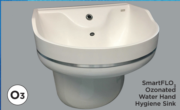
O 3 SmartFLO 3 Ozonated Water Hand Hygiene Sink

A sink without biofilm or risk of CPE outbreaks.