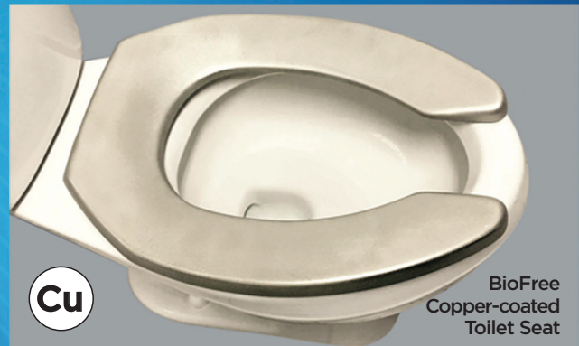
Cu BioFree Copper-coated Toilet Seat

A toilet seat that reduces bacteria almost on contact.