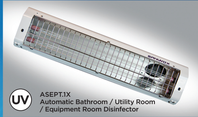
UV ASEPT.1X Automatic Bathroom / Utility Room / Equipment Room Disinfector

A patient bathroom that disinfects itself.