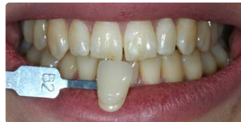
Before Boutique Whitening