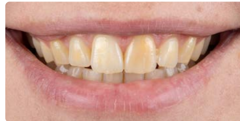
Before Boutique Whitening