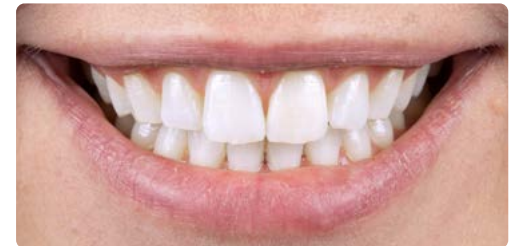
After Boutique Whitening