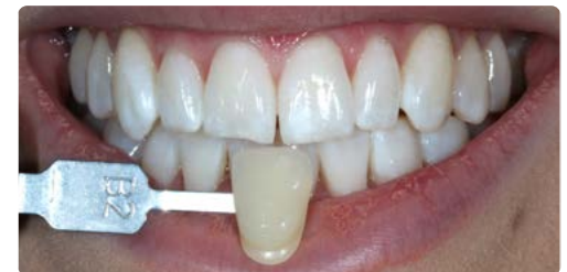
After Boutique Whitening